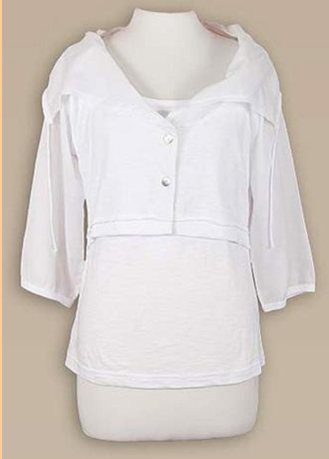
FU4 - Layer Top $49.95 Fusion - Colour Nature