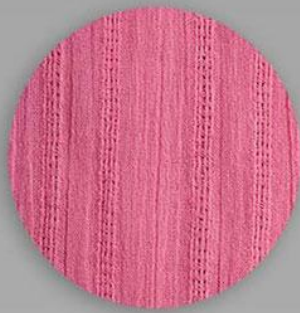
Fuchsia (Noblesse texture)