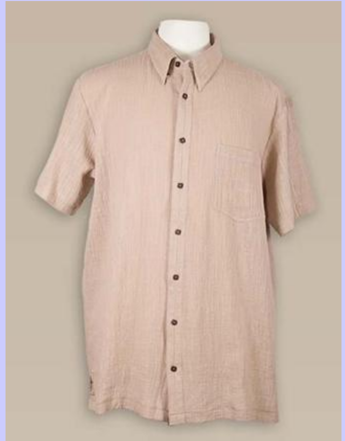
MU1–S/S Shirt, w/b/down collar $69.95 Unique – Colours Nature (not shown) & Wheat