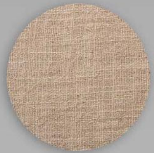
Wheat (Unique texture)