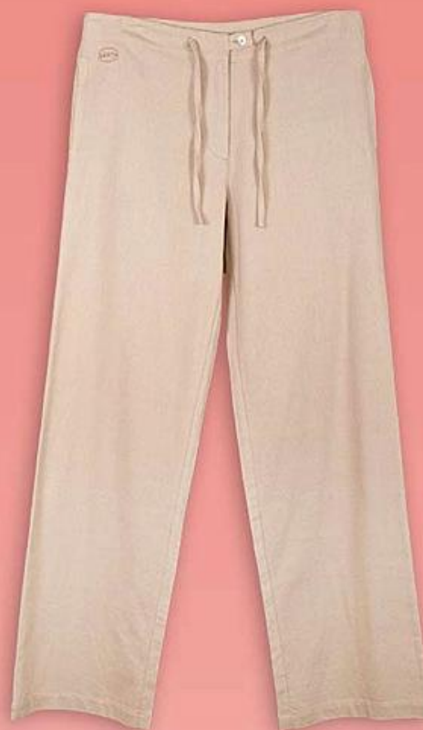
LSW257 – Long Pants $69.95

Woven Silk & Cotton – Colour Wheat (not shown)