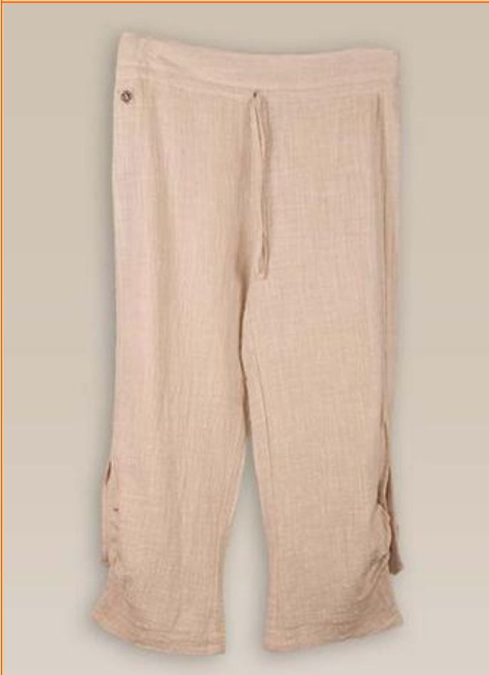
LU6 - Long Pants $59.95

Unique - Colours Nature & Wheat (not shown)