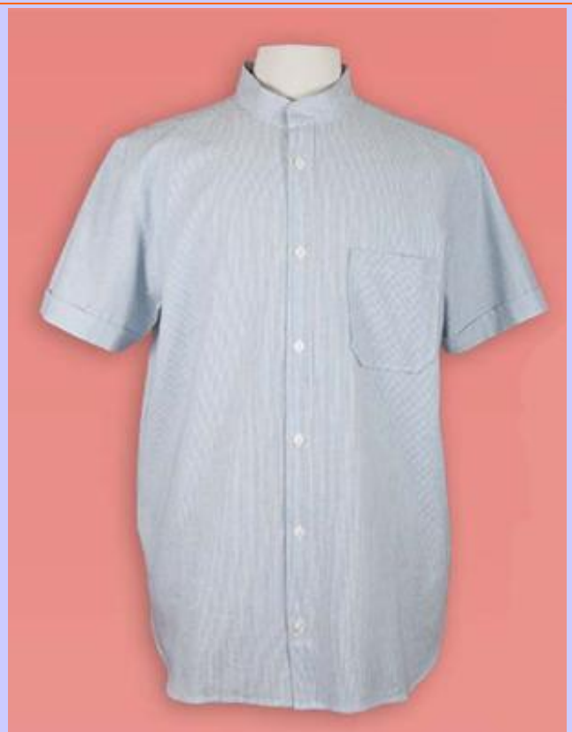
MSW63 – S/S Shirt, S/up Collar $74.95 Woven Silk & Cotton – Colours Blue Striped (Wheat – not shown $69.95)