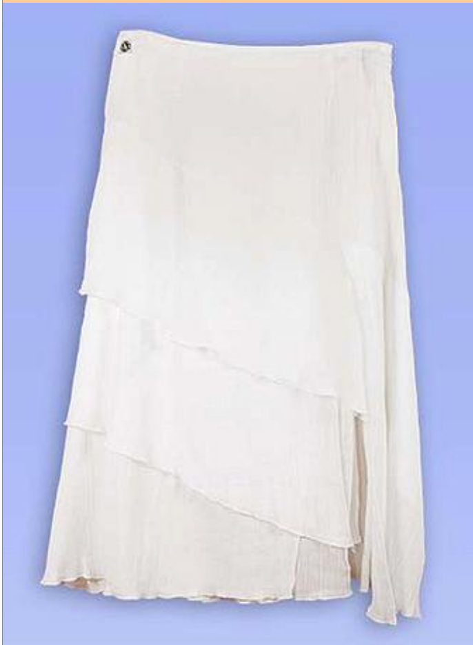
LN6 – Skirt \frac{3}{4} length $69.95

Noblesse – Colours Nature & Bluebell (not shown)