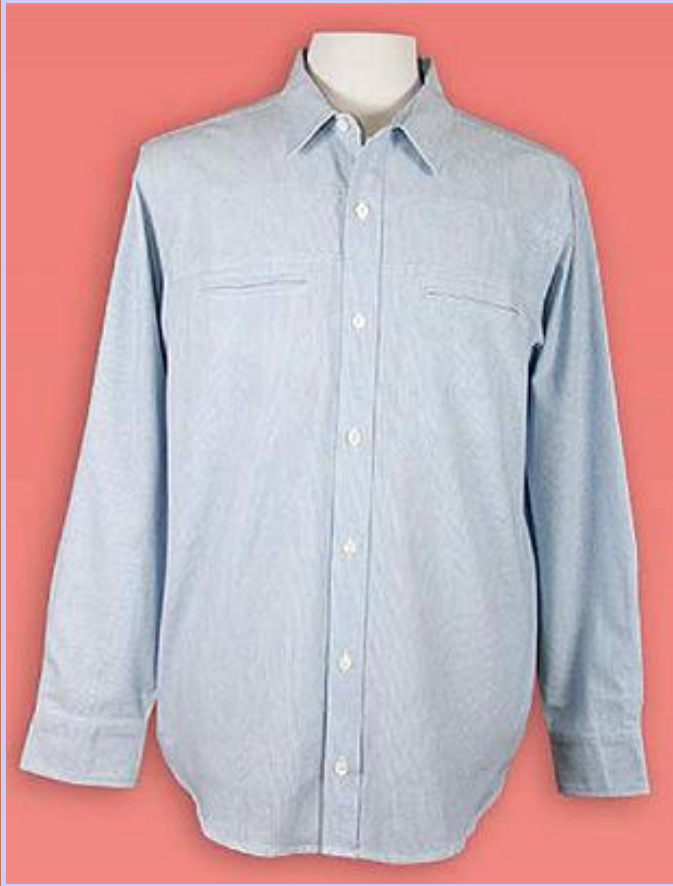
MSW65 – L/Slv. Shirt $89.95 Woven Silk & Cotton – Colour Wheat Striped (not shown)