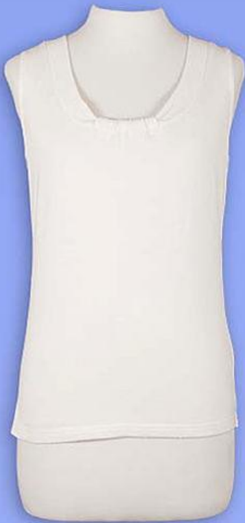
LSK216 – S/L Top w/neck effect $49.95 Thin Knit Silk & Cotton – Colours Nature & Peach (not shown)