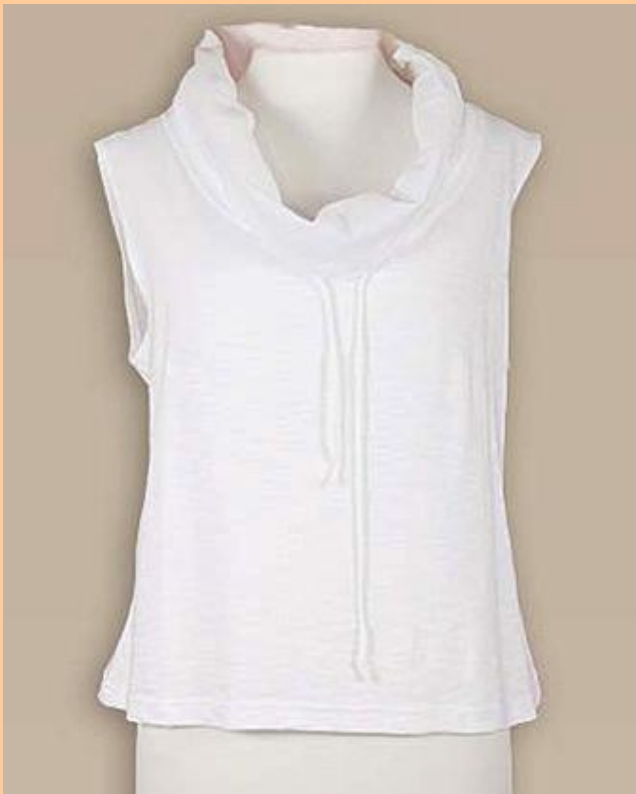
FU1 - S/L Top $39.95 Fusion - Colours Nature & Wheat (not shown)