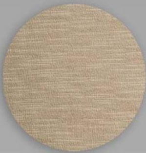
Wheat (Fusion texture)