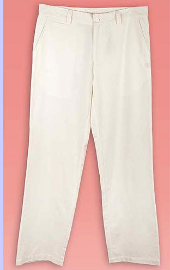
MSW66 – Long Classics w/side pockets $79.95 Woven Silk & Cotton – Colour Wheat (not shown)