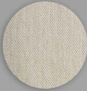
Douce (Herringbone texture)