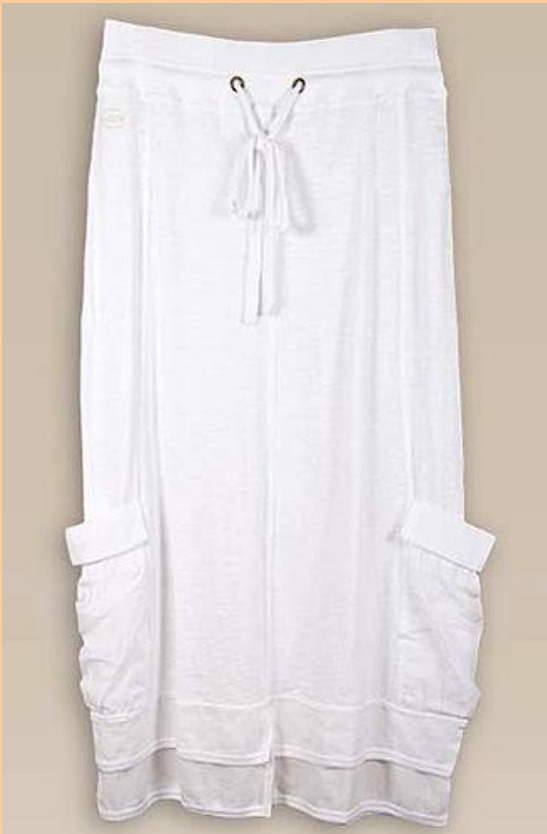
FU6 - Dress $54.95 Fusion - Colour Nature