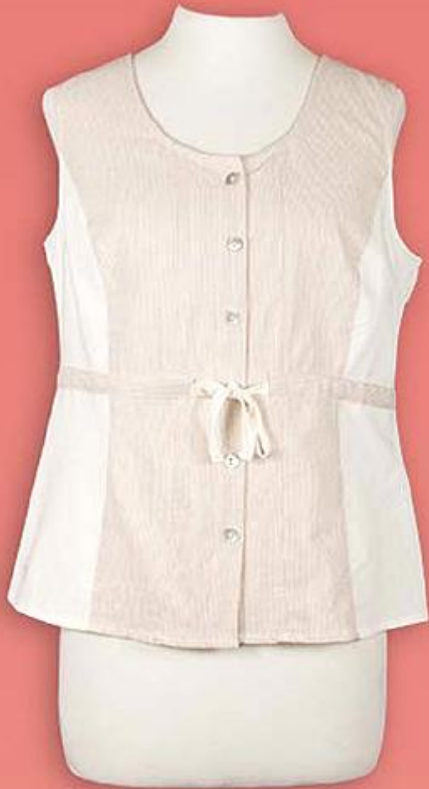
LSW260 (Matches LSW261) $69.95 Woven Silk & Cotton - Colour Wheat Striped