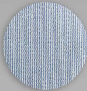
Bluebell Striped (Woven Silk texture)