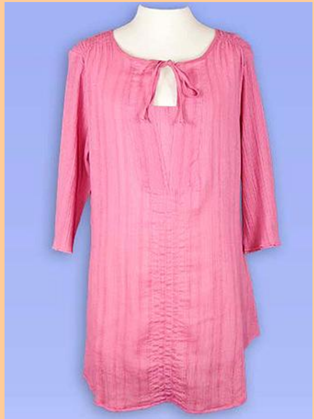
LN5 – Top ¾ sleeve w/tie $59.95 Noblesse – Colour Fuchsia