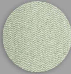
Mint (Herringbone texture)