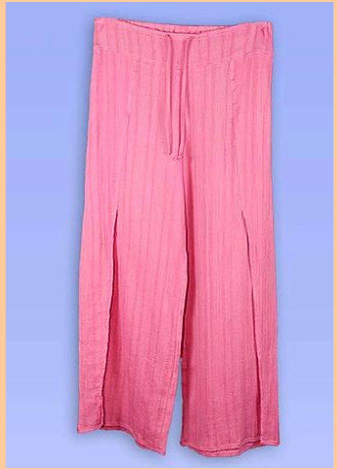
LN7 – Long Pants $59.95

Noblesse – Colours Nature & Bluebell (not shown)