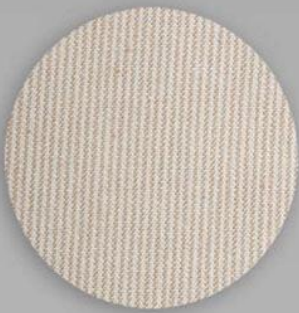
Wheat Striped (Woven Silk texture)