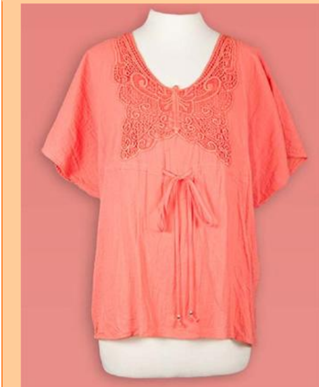
LBH8 – Top $64.95

Noblesse – Colours Nature (not shown) & Fuchsia