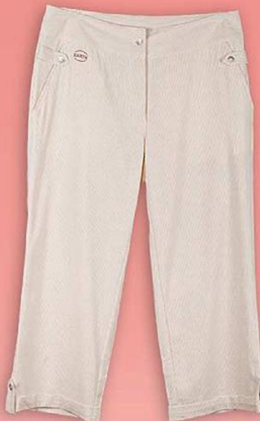
LSW255 – Pants $74.95

Woven Silk & Cotton – Colour Blue Striped (not shown)