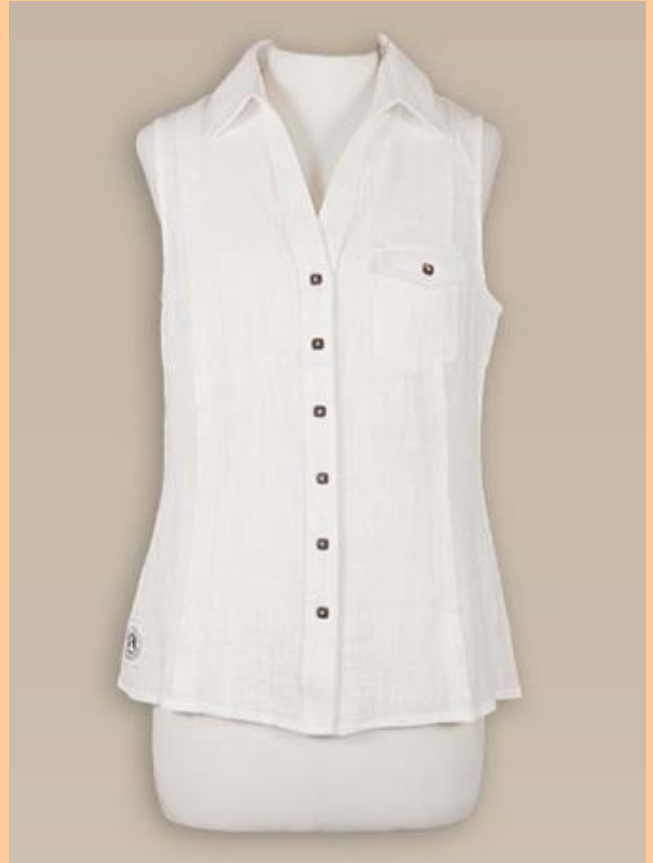
LU1 – Sleeveless Shirt $59.95 Unique – Colours Nature & Wheat (not shown)