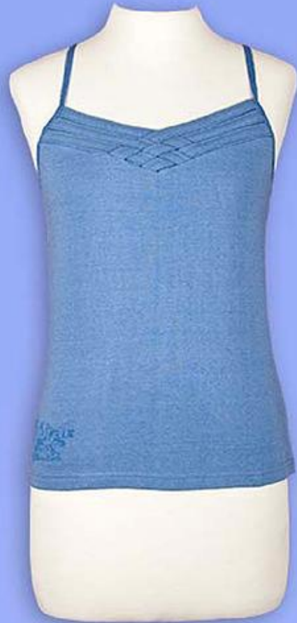
LSK215 – Strap Top $49.95 Thin Knit Silk & Cotton – Colours Wheat (not shown) & Bluebell