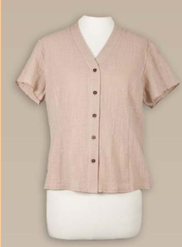
LU2 - S/S Shirt $54.95

Unique - Colours Nature (not shown) & Wheat