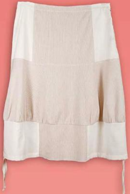
LSW261 - 3/4 Length Skirt $89.95 Woven Silk & Cotton - Colour Wheat Striped