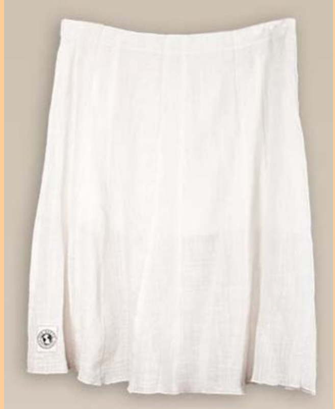
LU5 - Skirt $69.95

Unique - Colours Nature (not shown) & Wheat