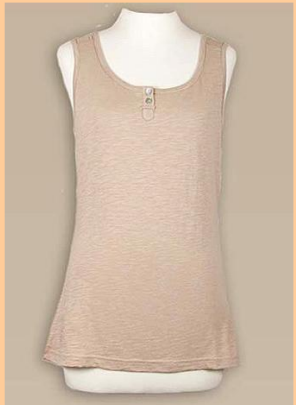
FU2 - Singlet Top $34.95 Fusion - Colours Nature (not shown) & Wheat