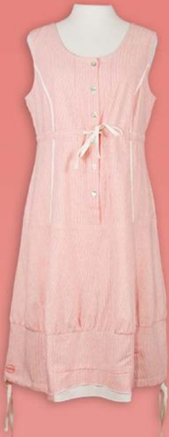
LSW263 - S/L Dress $99.95 Woven Silk & Cotton - Colour Peach Striped