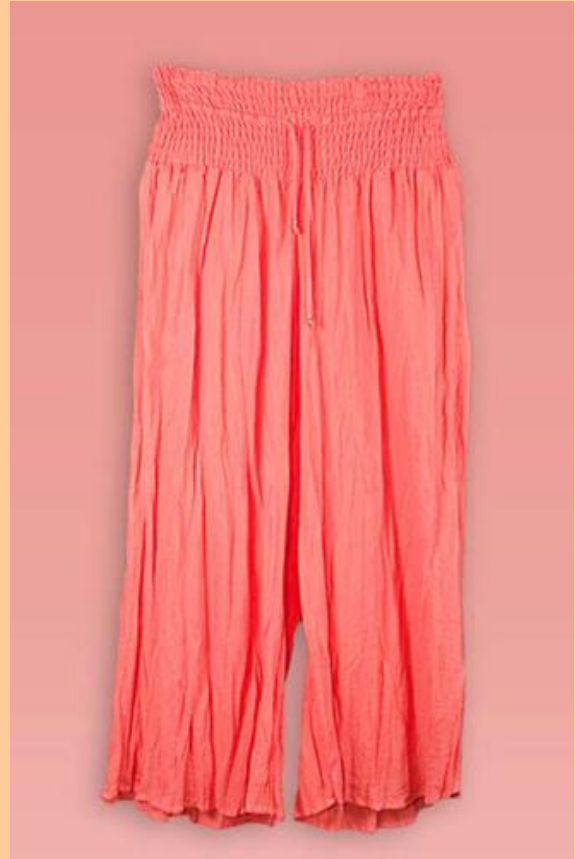
LBH11 – Long Pants $59.95 Bohemian – Colours Nature (not shown) & Peach