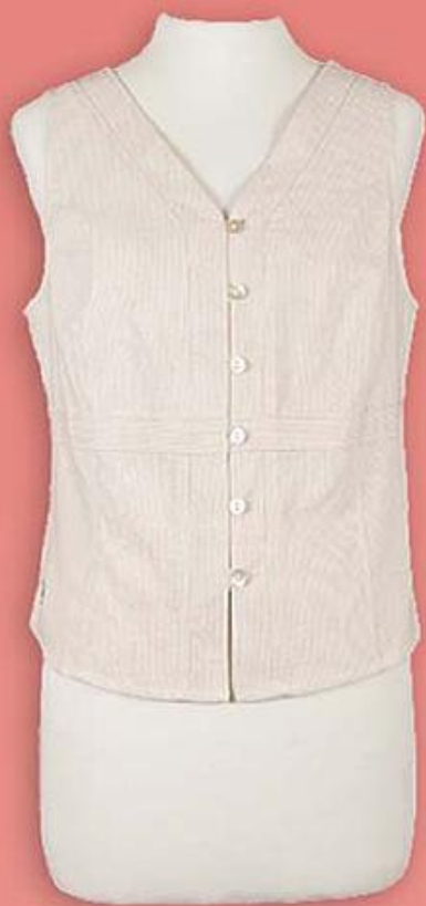
LSW253 – S/L Top $54.95