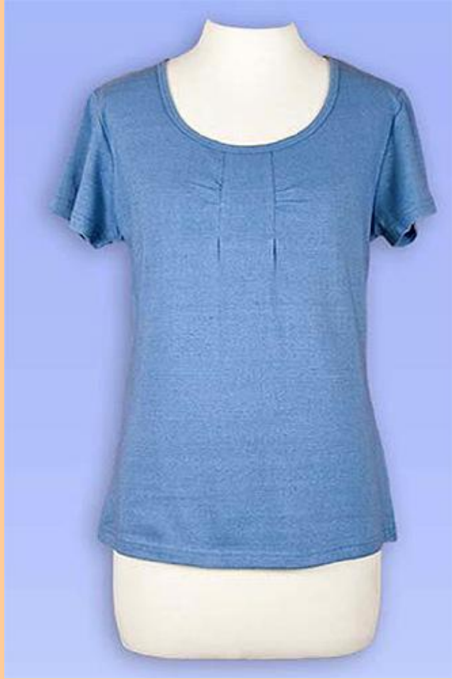
LSK219 – S/S Classic Top $49.95

Thin Knit Silk & Cotton – Colours Bluebell & Peach (not shown)