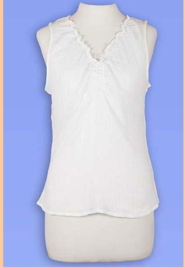
LN3 – Sleeveless V-neck Top $44.95 Noblesse – Colour Bluebell (not shown)