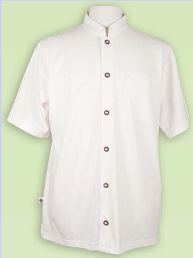
M104 – S/S S/up Collar, Pocket $59.95 Cotton Herringbone – Colour Douce (not shown)