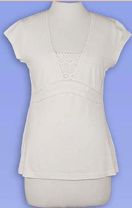
LSK218 – Mini Slv Top w/lace $54.95 Thin Knit Silk & Cotton – Colours Nature & Wheat (not shown)