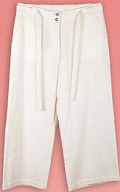
LSW256 – ¾ Pants $69.95

Woven Silk & Cotton – Colour Blue Striped (not shown)