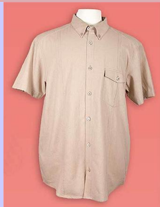
MSW62 – S/S Classic, B/D Collar $74.95 Woven Silk & Cotton – Colour Wheat Striped