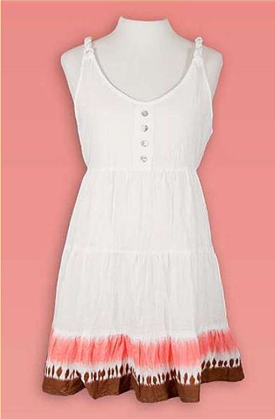
LBH10 – S/L Dress w/print $59.95 Bohemian – Colours Nature & Peach (not shown)