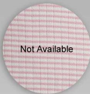
Fuchsia Striped (Baby Organic texture)