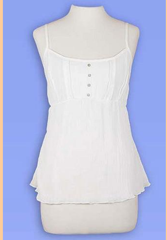
LN1 - Strap Top $44.95 Noblesse - Colour Nature