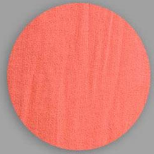
Peach (Bohemian texture)