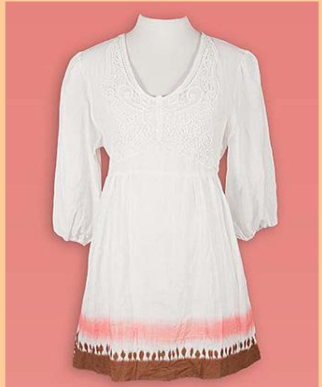
LBH9 – \frac{3}{4} Sleeve Dress w/print $69.95