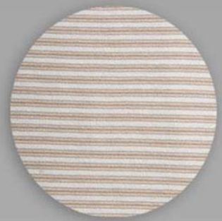
Wheat Striped (Men's Organic texture)