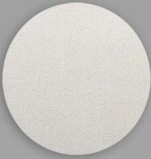
Nature (Knitted Silk texture)