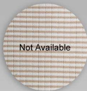
Wheat Striped (Baby Organic texture)