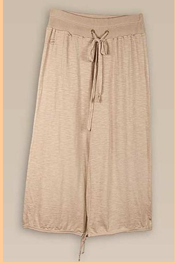
FU5 - 3/4 Pants $54.95 Fusion - Colour Wheat