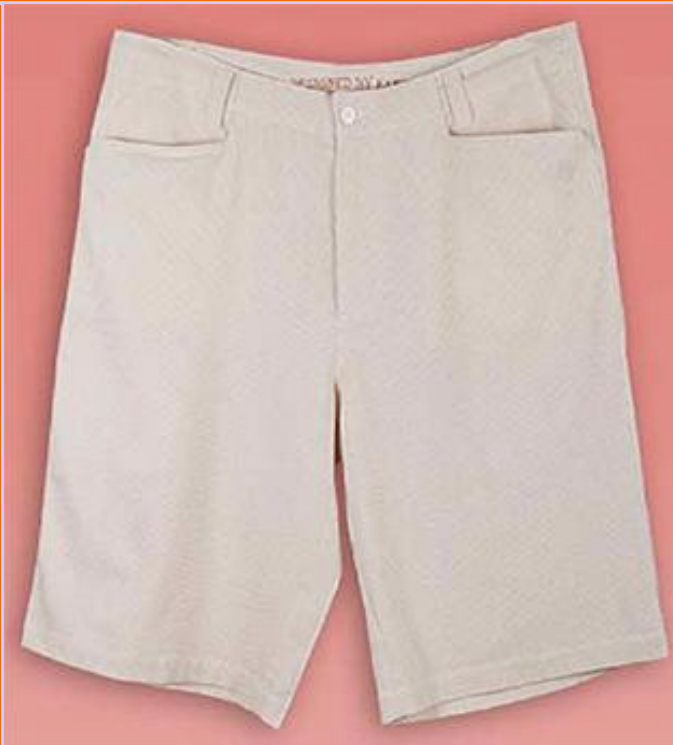
MSW67 – “Cool” Bermuda Shorts $69.95 Woven Silk & Cotton – Colours Wheat Striped & (Nature & Wheat – not shown $64.95)