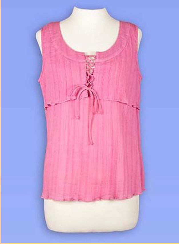
LN2 – Sleeveless Lace-up Top $49.95 Noblesse – Colour Nature (not shown)