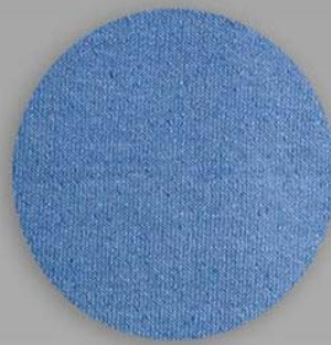
Bluebell (Knitted Silk texture)