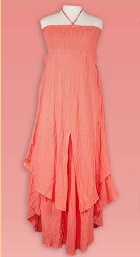
LBH12 – Dress $79.95 Bohemian – Colour Peach