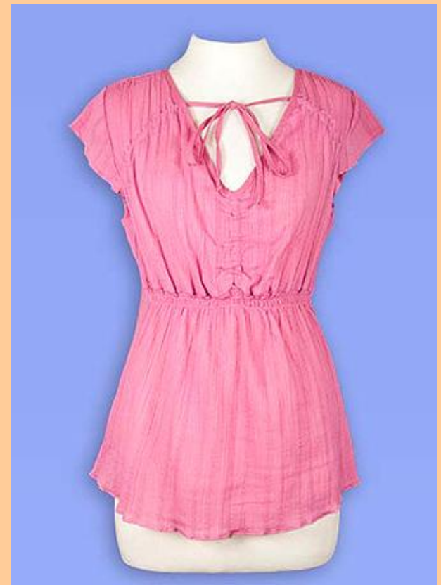
LN4 – Top w/cap sleeves, V-neck $54.95 Noblesse – Colour Fuchsia