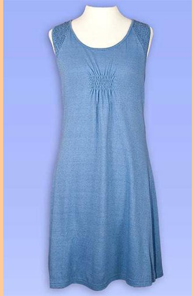
LSK224 – ¾ Length S/L Dress $69.95

Thin Knit Silk & Cotton – Colours Bluebell & Peach (not shown)