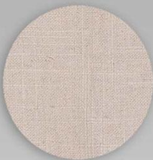
Sand (Authentic texture)