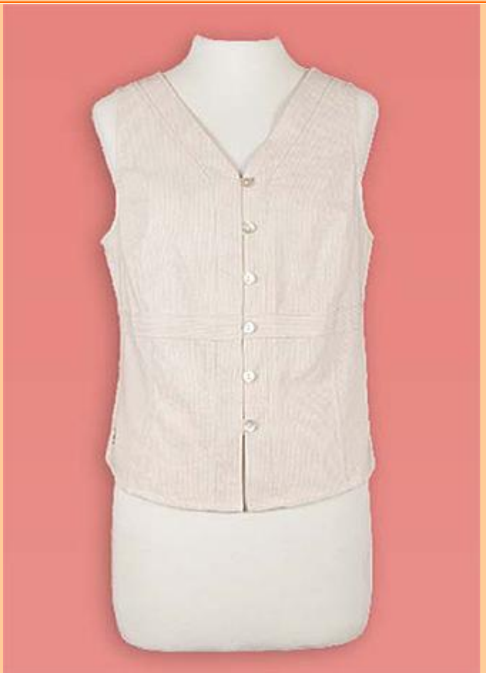
LSW250A - S/L Top $59.95

Unique - Colours Nature (not shown) & Wheat